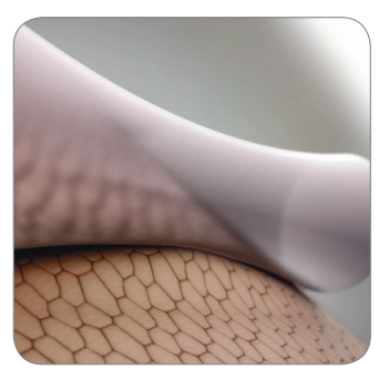
Dressings with Safetac cause no trauma to the wound or surrounding skin