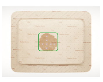
E.g. 4x4cm. Fluid will begin to appear on the back of the dressing.