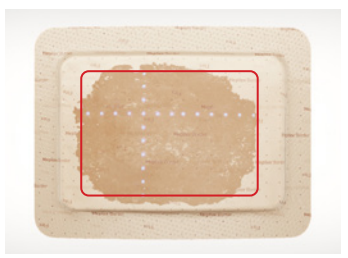
Consider dressing change when exudate is approaching the edges of the dressing.